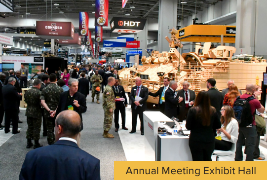
Annual Meeting Exhibit Hall